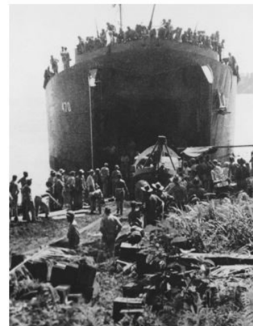
Loading up and leaving Biak Island on LST 470.