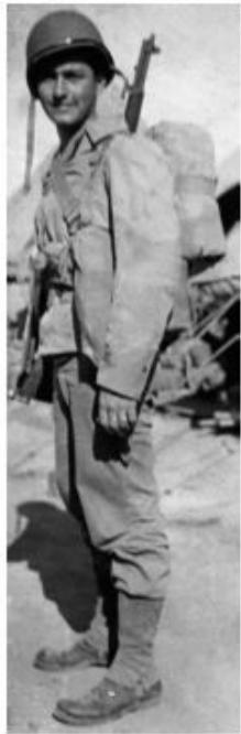
My dad with full pack is ready to get on the ship and move out to New Guinea. Photo taken in Townsville, Australia. Dad wrote on back of photo: "Gas mask on side; blankets, toilet articles, underwear and camera in my back pack. July 31, 1943."