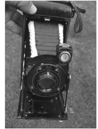
This is the camera my dad used to document his journey across the Pacific.