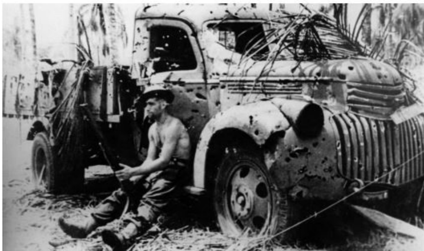
A soldier sitting on a bullet-riddled truck.